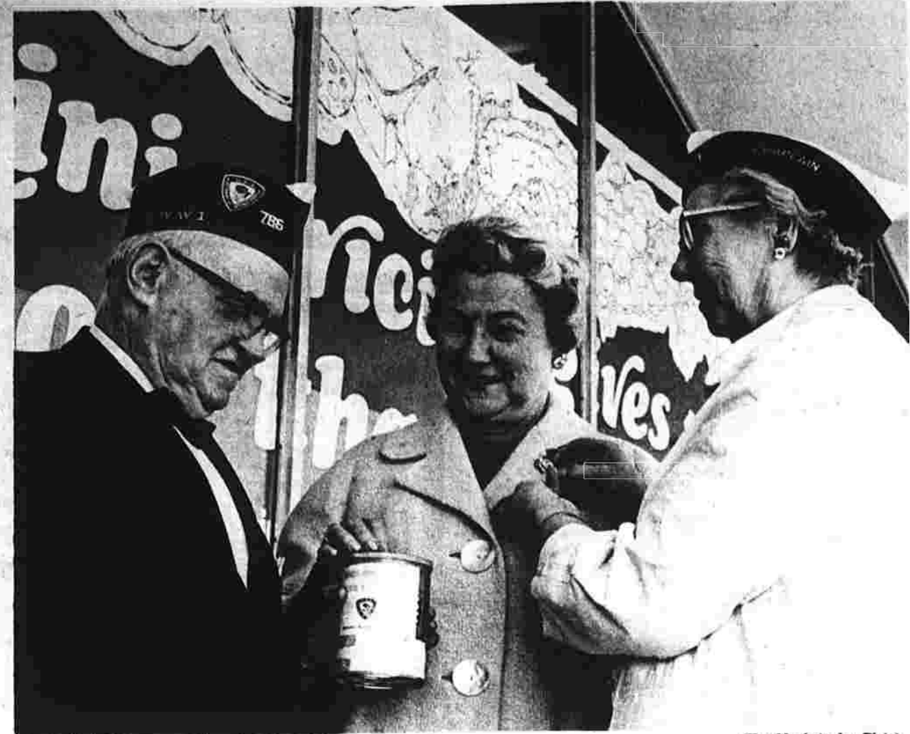
Torch Drive for WWI Vets Hospital Fund