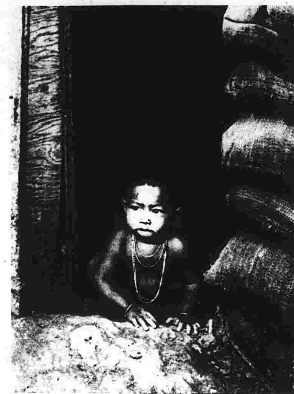
Montagnard baby sits in the entrance of his parents' bunker, which is heavily fortified with sandbags at the Dak Seang Special Forces camp 266 miles northeast of Saigon.