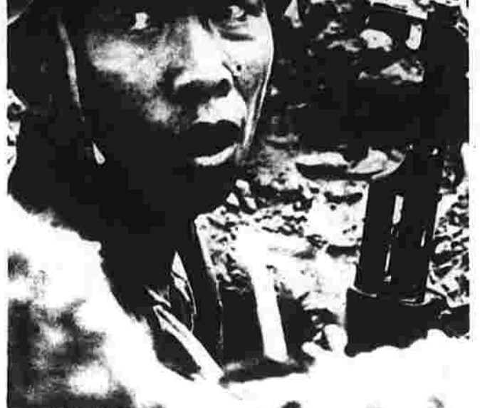
A Cambodian soldier, grasping his rifle, waits for further action in fighting

WASHINGTON (AP)—The Pentagon announced today the United States will send advisers, tactical air strikes and other support for South Vietnamese operations in Cambodia. It called the move "a necessary and effective measure" to save U.S. and other allied lives.